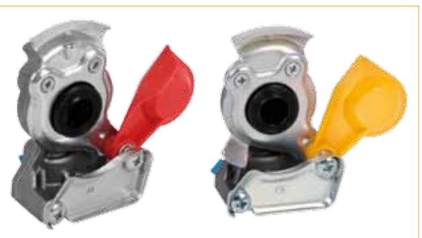
AUTOMÁTICA 284 311 221 - 229 311 212