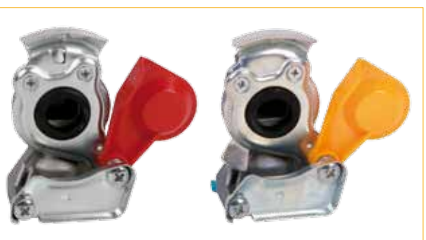
STANDAR 229 311 021 - 229 311 012